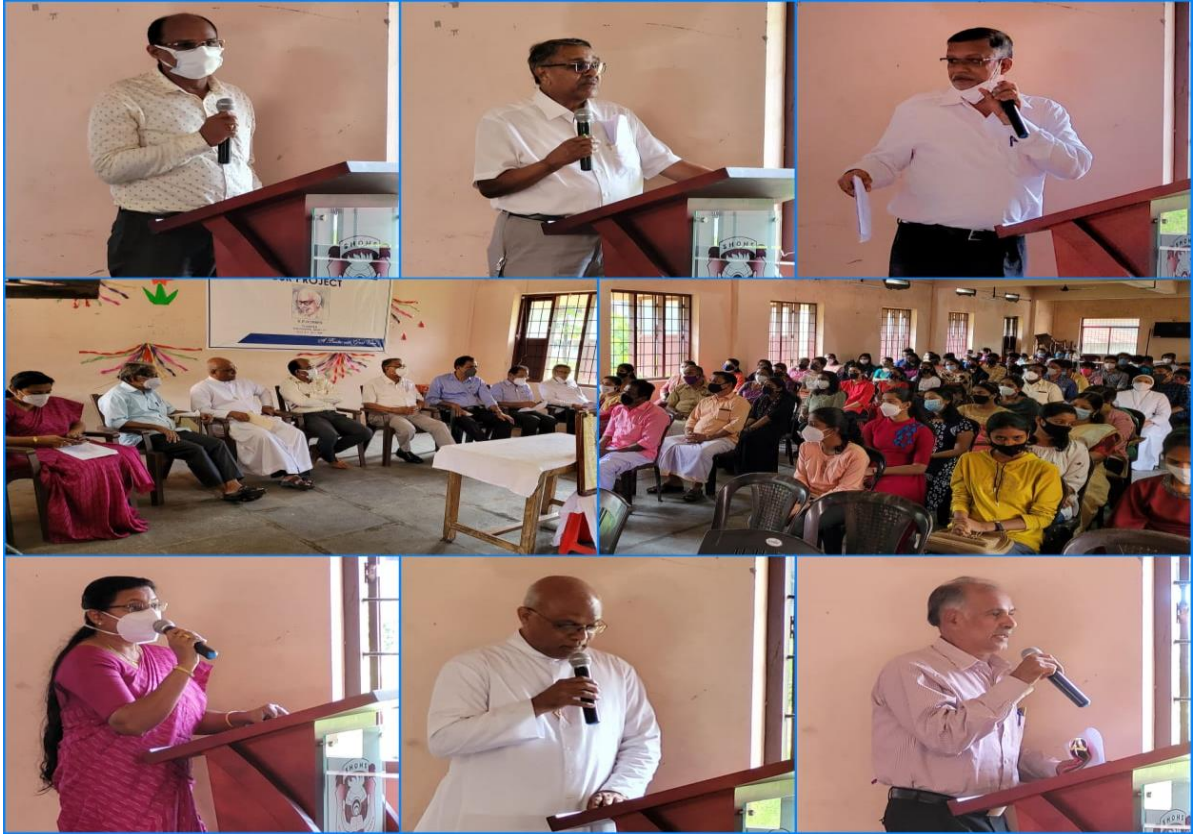
Support to Kurji Family Hospital- Br Patna.