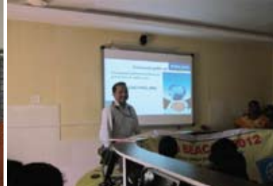
(Stills of Yuva Beacon Sessions held at various locations)