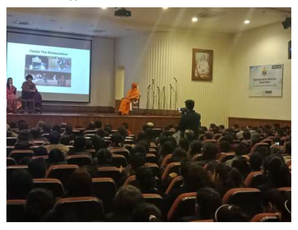
Support to Ramakrishna Mission, New Delhi