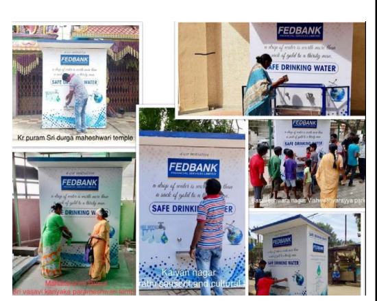
Water ATM's installed