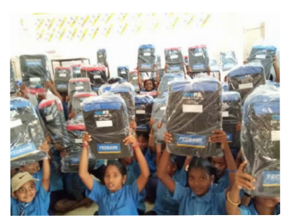
Distribution of Deskits